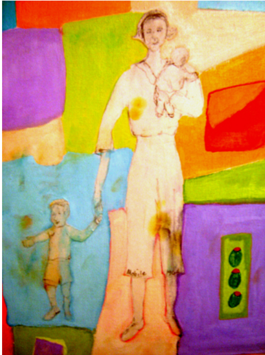
DECADES, 2 of 6 Liz Reed