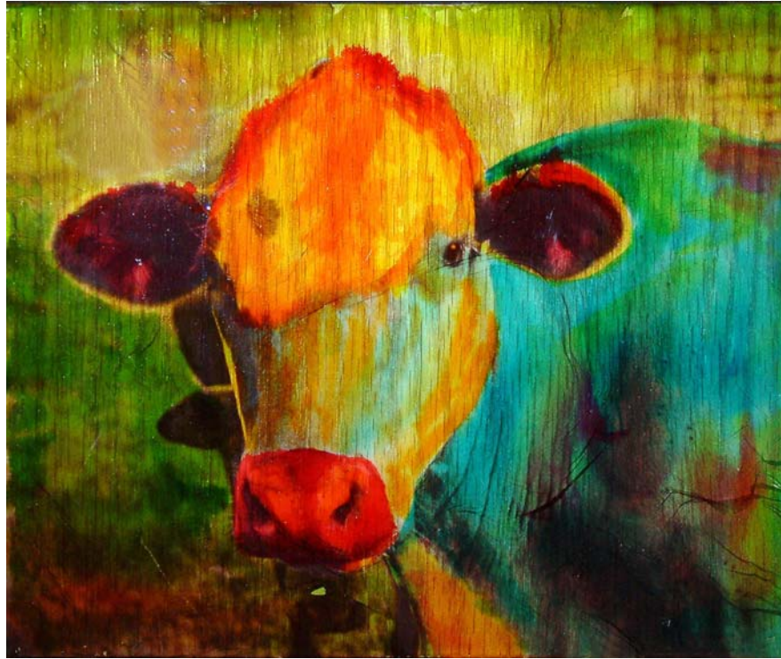
UNTITLED