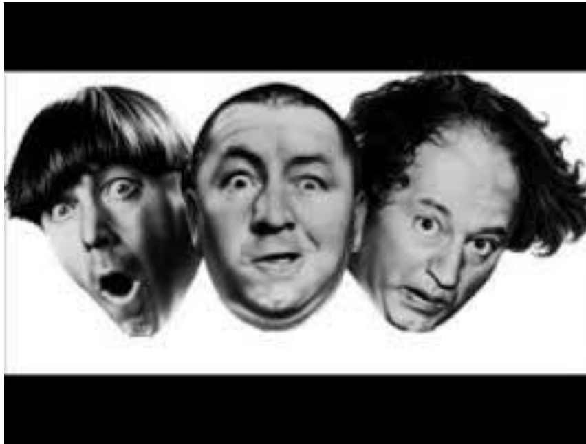
THE THREE STOOGES